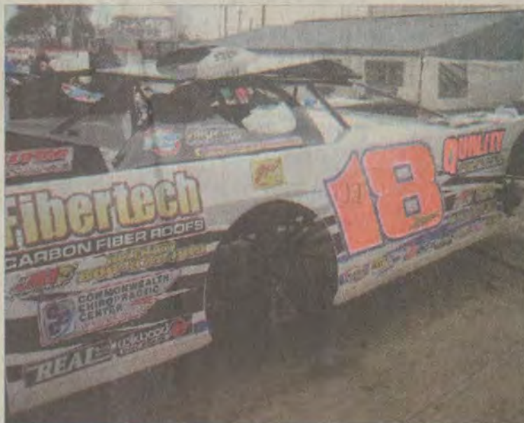
Brandon Kinzer Motorsports has placed the No. 18 Late Model on tracks in many different states. Brandon Kinzer has raced both Late Models and Modifieds.

July 1 at Portsmouth (Ohio) Raceway Park, Lucas Oil, $10,000-to-win July 7 at Volunteer (Tenn.) Speedway, Lucas Oil, $10,000-to-win July 16 at Wythe (Va.) Raceway, Southern Nationals, $3,500-to-win July 17 at Cherokee (SC) Speedway, Southern Nationals, $3,500-to-win July 19 Tri-County (NC) Race Track, Southern Nationals, $3,500-to-win July 20 Lavonia (Ga.) Speedway, Southern Nationals, $5,300-to-win