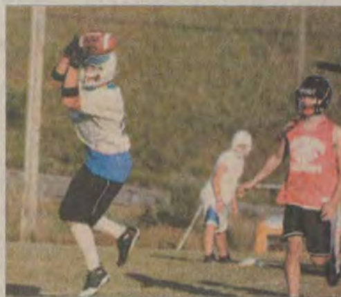
Prestonsburg wrapped up a busy June passing session with a camp at StoneCrest Mountain.

The Blackcat Touchdown Club is currently selling fence signs and reserved seats for the upcoming season. Another promotion the Prestonsburg High football boosters club has going is a $10,000 giveaway. Tickets are currently being sold for a $10,000 prize to be given away at halftime of the Joe P. Tackett Gridiron Classic on Friday, Aug. 24. The inaugural Joe P. Tackett Gridiron Classic will pit host Prestonsburg versus Floyd County rival Betsy Layne. For more information, contact any member of the Blackcat Touchdown Club.