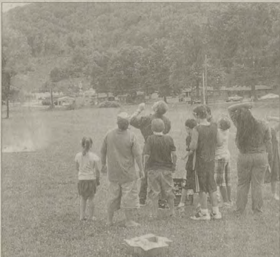
Up, up and away! Campers look to the sky as a successful launch takes place.