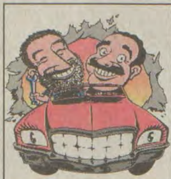
CLICK & CLACK Talk Cars