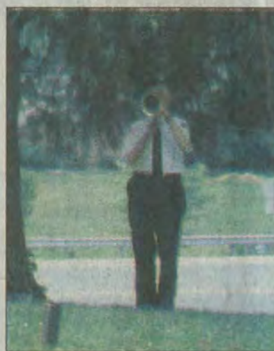
A bugler played "Taps" near the conclusion of Sunday's ceremony.