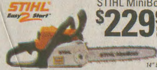
Great for homeowners! Now features the STIHL Easy2Start™ System.

STIHL Easy2Start™ STIHL MiniBoss™ $229.95 MS 180 C-BE