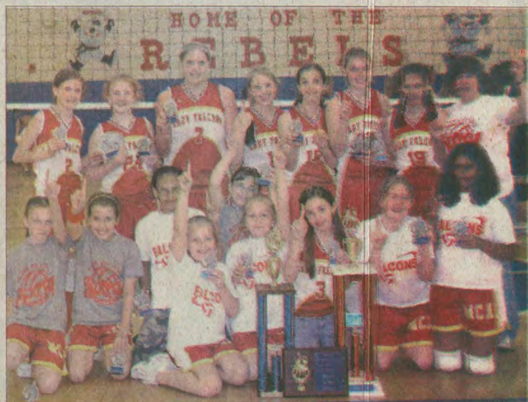
NUMBER ONE: The Mountain Christian Academy (MCA) volleyball team captured this year's Floyd County A-team championship.