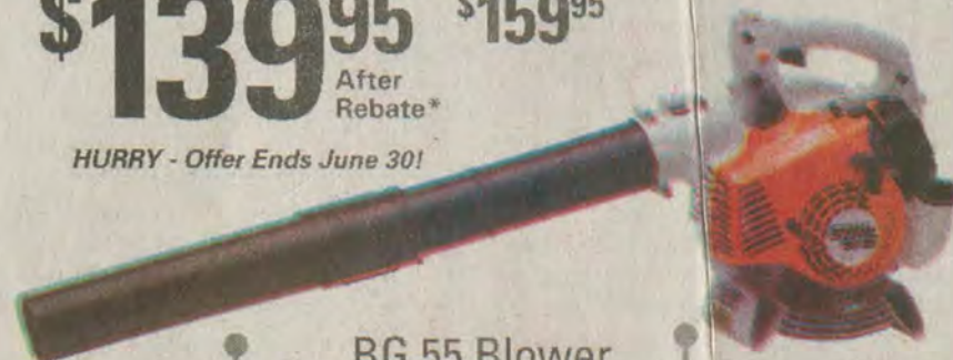
BG 55 Blower

SAVE $20.00! NOW JUST $139.95 After Rebate* WAS $159.95 HURRY - Offer Ends June 30!