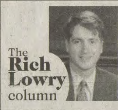
The Rich Lowry column

Rich Lowry is editor of the National Review.