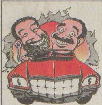
CLICK & CLACK Talk Cars

I've got a good buddy who broke his left arm under moronic circumstances, which I won't go into. Now, without any use of said left arm, he's doing a lot of city driving (Chicago) in a Saab with a manual transmission. That he's doing this also seems moronic to me, and I've told him so, but he says