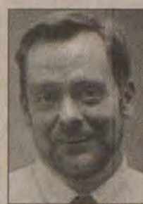
Tom Doty Staff Writer

Prepare to double over with laughter with this two-sided DVD, which includes a pair of movies for the price of one. The films are twins as each is a take on the old "two heads are better than one" adage, though they don't exactly state their case very well. Instead, each movie demonstrates that two heads can share a body but will otherwise get along like two wet polecats in a gunny sack.