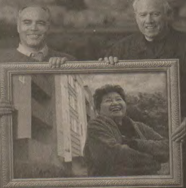
San Francisco Organizing Project, San Francisco, CA

One in ten seniors lives in poverty. One neighborhood said no.