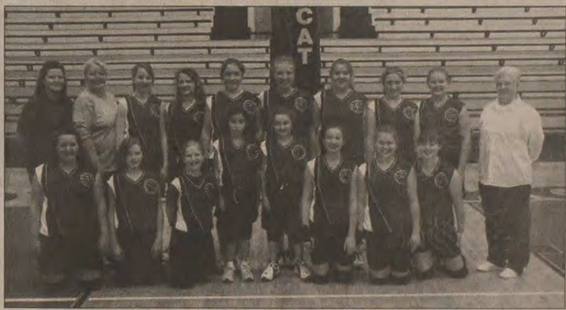
NET WORTH: Adams Middle School (above) and Mountain Christian Academy (below) are each fielding volleyball teams. The two met up Thursday night at Prestonsburg High School.