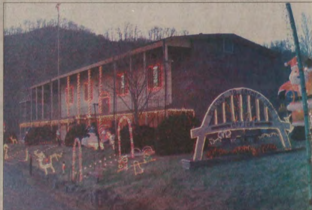
Many local residents have been enjoying the Christmas scene at Archer Park. The Prestonsburg Women's Club is hosting the annual Christmas in the Park on Dec. 15 at 6 p.m. in the skating rink. Children (up to 12 years old) can visit with and receive gifts from "Santa." For the next three weeks, "Santa" will be on call at Archer Park every Friday and Saturday between 6:30 p.m. and 8:30 p.m. to interact with children. Bring your camera.