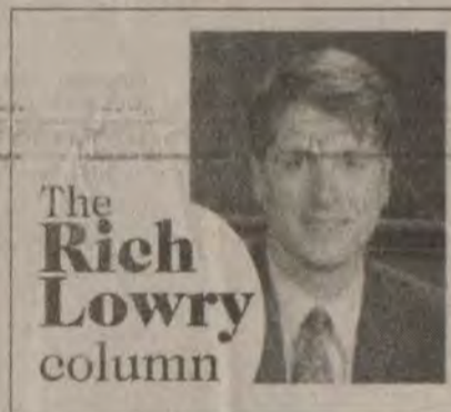
The Rich Lowry column

Rich Lowry is editor of the National Review.