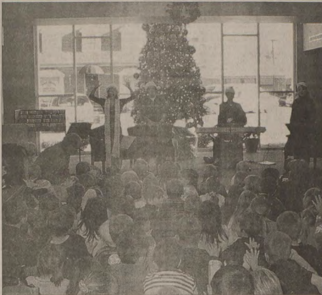
Jenny Wiley Theatre's "Holiday Shorts" performance series got underway this past week at the Floyd County Library. The group will be in both Martin and Grethel on Monday and in other areas of the region throughout December.