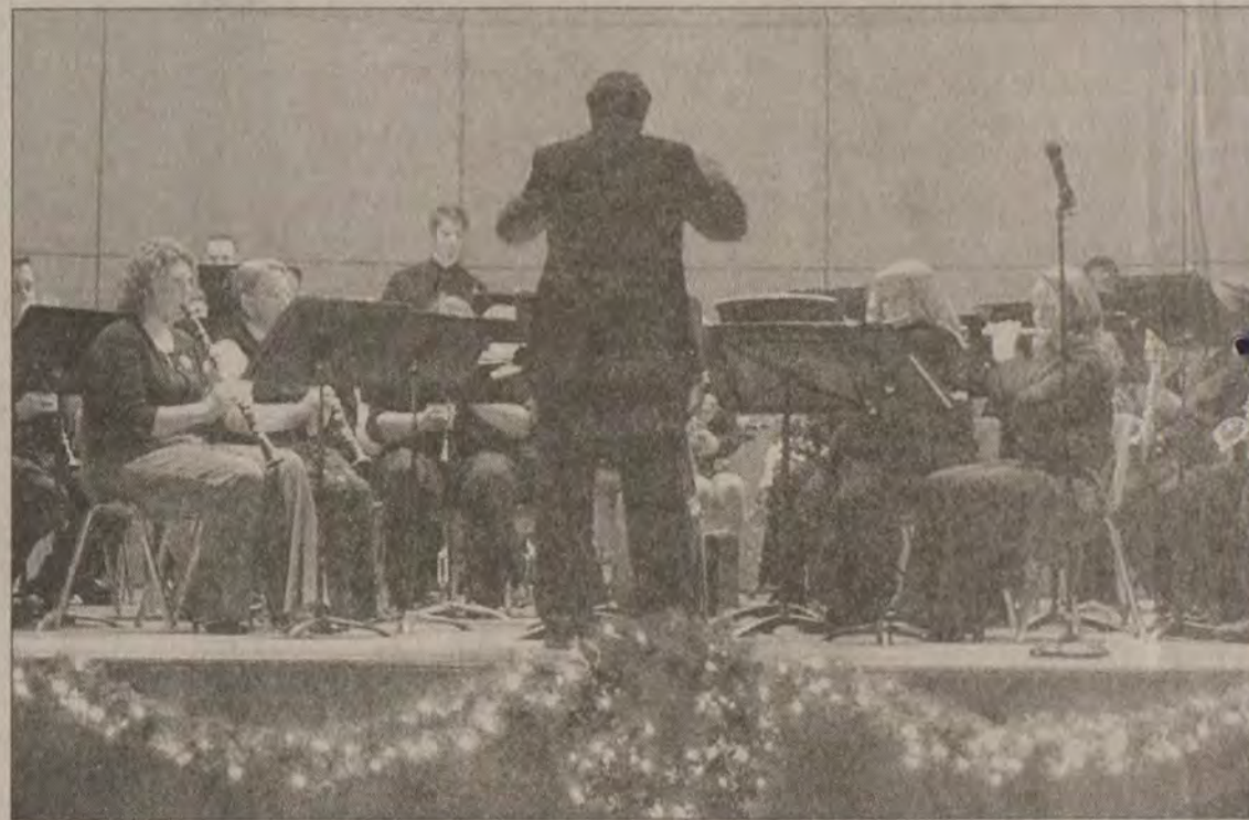
The Pikeville College Symphony Band will perform a Christmas concert on Thursday.

Fast-forward several years and several hundred franchises later: I wonder if the runt at the door was his inspiration. ("After all, EVERYBODY loves doughnuts.") In futile search, I've torn my folks' basement apart, but it seems I've lost that purple-lined piece of Canadiana, the testimony to a feat that is surely mine alone to claim: I sold Tim Horton a dozen doughnuts.