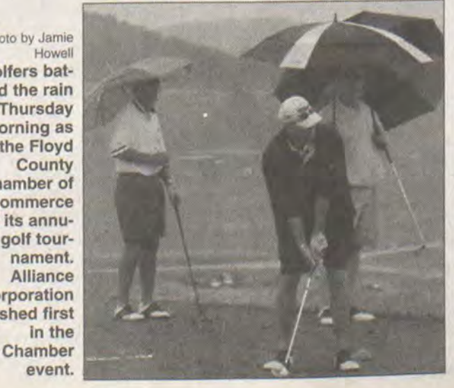
Golfers battled the rain Thursday morning as the Floyd County Chamber of Commerce held its annual golf tournament. Alliance Corporation finished first in the