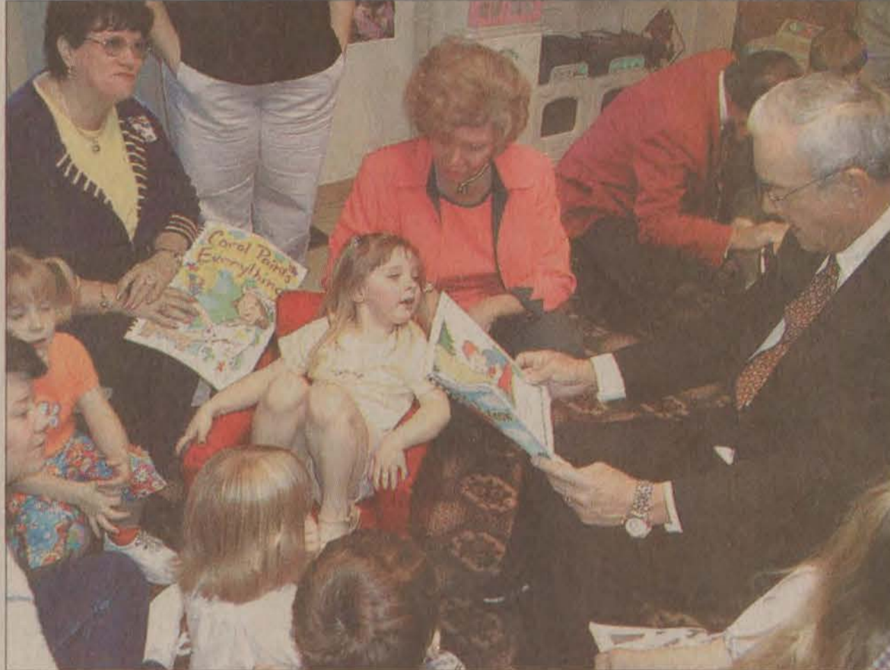
Gov. Paul Patton toured TLC Child Development Center in Paintsville Friday morning, shortly before attending a meeting of the Kentucky Appalachian Commission in that city. Patton went to the day care center to observe Child Care Provider Appreciation Day, which he has designated during a day in May the past seven years. While there, Patton appeared to enjoy interacting with the children, reading stories to most of the five classes there that morning. At left, he helped one student find his name on the wall.