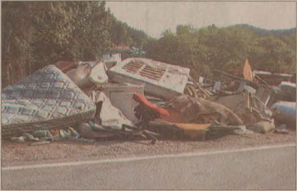
Breathitt County thought it was helping combat its garbage problem by providing locations for residents to drop unwanted refuse. But the program itself is being scrapped after participation — and mountains of trash — grew beyond expectation.

Now the good intentions are becoming a series of major junk piles. People are began to set out car parts, household appliances, furniture, tires, stoves, refrigerators and other large items. Now the county is going back to a policy of making everyone responsible for getting rid of their own trash. Anyone living in Breathitt County who has items that need to be removed can contact their local solid waste coordinator.