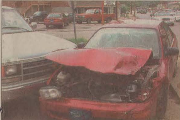
Four people were transported to Highlands Regional Medical Center as a result of a two-vehicle accident at North Lake Drive and Patton Street on Friday.