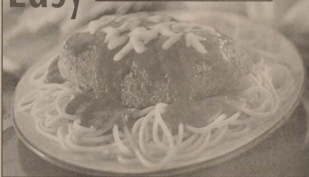
No-Frying Chicken Parmesan