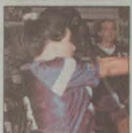
Volleycats beat Bobcats in two