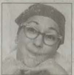
Frolic at the MAC on Comedy Night