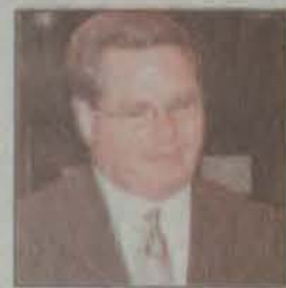
Finalist for president's position at PCC meets with staff, students and community members