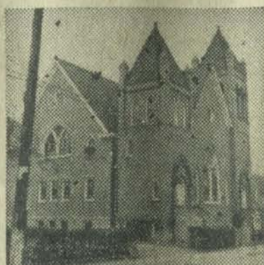
FIRST METHODIST CHURCH