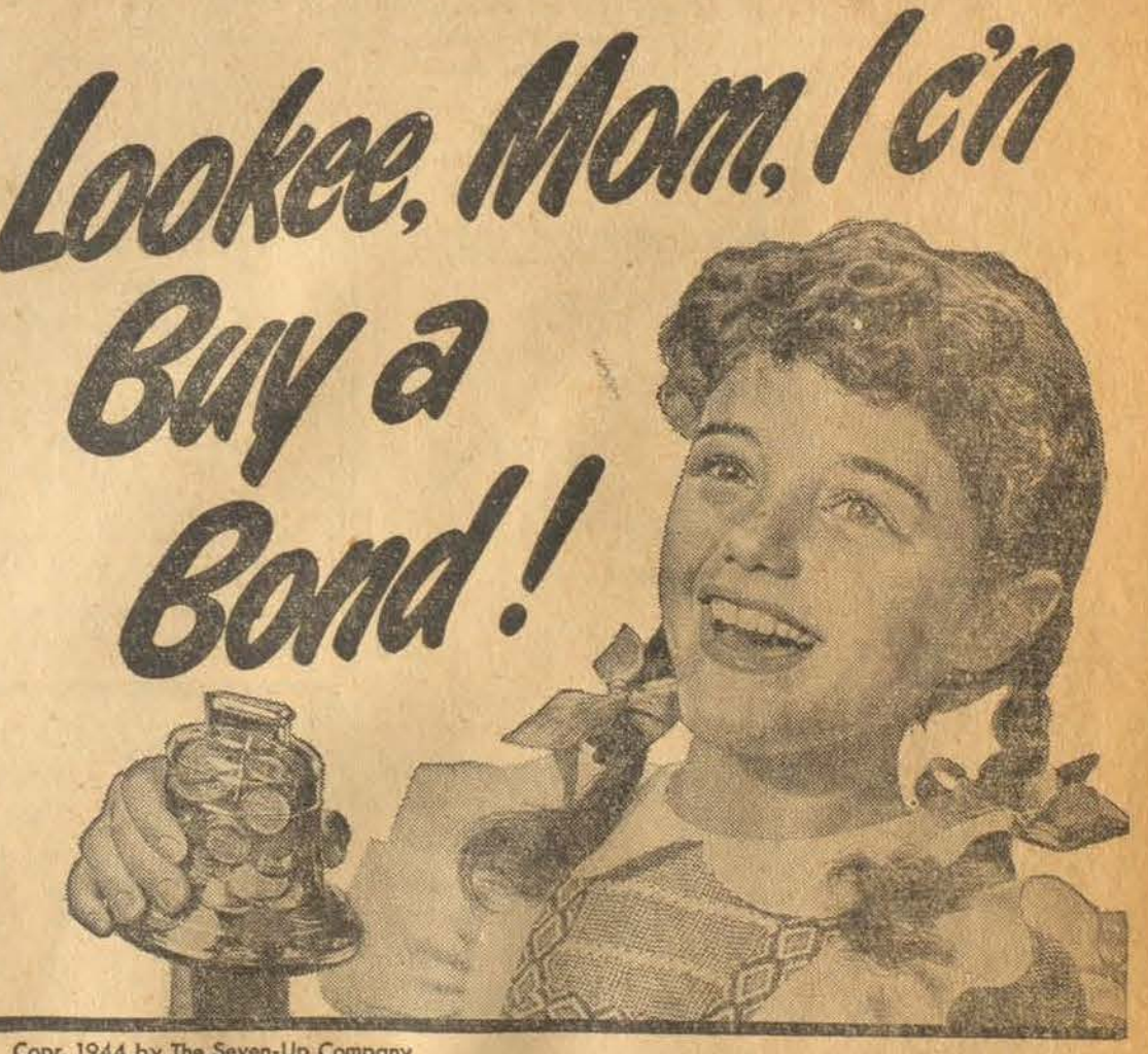
Copr. 1944 by The Seven-Up Company

It's not the size of the help you are giving our country that measures your size as a "fighter-backer". The true measure is the greatness of your spirit . . . whether or not you are doing all that you can. Not until you have reached that standard can the wee small voice within you say — "Now you're a full-fledged 'fighter-backer'. Now you're a real American.