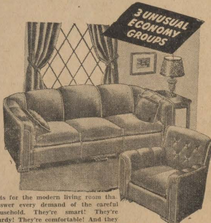
Sets for the modern living room that answer every demand of the careful household. They're smart! They're sturdy! They're comfortable! And they represent the most exceptional values we've seen in years.