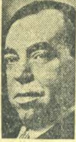
Irvin S. Cobb

So please don't come telling me that the sit-down strike is a new notion or that somebody in Europe first thought it up. Thirty years ago I saw my lady elephant friend, Helen, putting on one, all by her four-ton self.