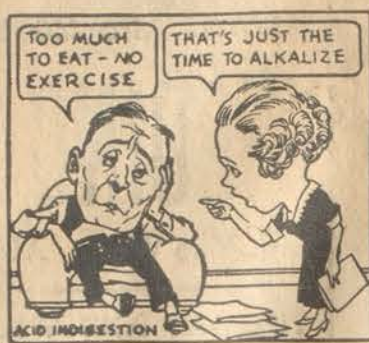
He felt a different man next day. Relieved the Alka-Seltzer way.