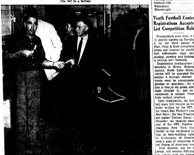
Annual Fund Drive For Floyd County Retarded Childrens Council