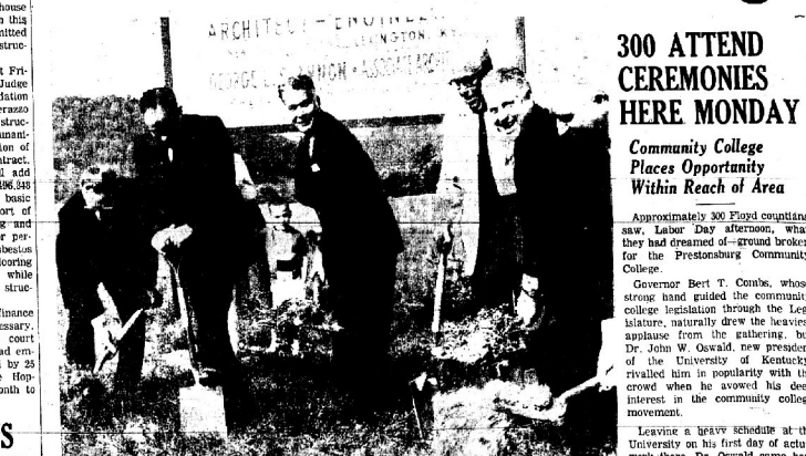
Approximately 300 Floyd county and area residents gathered for the ground-breaking ceremony of the new college building at the University of Kentucky campus in Lexington.