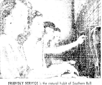
ncouraged by good training and supervision.

YOU SEE the road's in the performance of Telephone alls every die, You see it in ever-proving skill, ex-rience had tennaork ..., in ever-improving service r all who use the telephone.