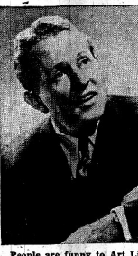
People are funny to Art Linkletter, his laugh-along program on Tuesdays at 10:30 p.m., EST, goes out of the way to prove exactly that. He masterminds the situations taking place on WLW-NBC's "People Are Funny" program.