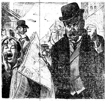
"I'll be fired for that fool story!"

FOR SALE —1 1940 Ford dump truck and 1 1941 Dodge dump truck. ALLEN WEST.