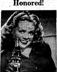
ALICE FAYE, gorgeous star of the 20th Century-Fox picture, "Fallen Angel," honors her taste-test winner—Royal Crown Cola! Try it yourself. Say "RC for me!" That's the quick way to get a frosty bottle of Royal Crown Cola—best by taste-test!

ROYAL CROWN BOTTLING CO. Paintsville, Ky.