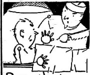
Doc-that reminds me

Remove Stains, add New Sparkle to NO BRUSHING KLEENITE the Brushless Way Get KLEENITE today at Hughes Drug Store and all good drugstore.