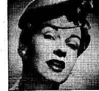
"My Gulf man has been a big help. Regularly he gives the car Gulfpride* and Gulflex**... He says that it's keeping it running a long time yet."