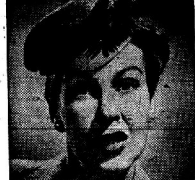
"Ours is an old car, and I'm taking the best care of it I know how."