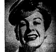
"I forgot to straighten out my insurance on the new house. Wait a minute, I'll be right back. Far-fetched, maybe, but a wise step at that."

*GULFPRIDE FOR YOUR MOTOR... **GULFLEX FOR YOUR CHASSIS