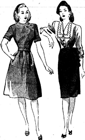
ALL STYLES AND MATERIALS

A dash of exciting seasoning—for the new season! Come see our collection dresses for daytime and dates! See the peplum, tunic, shirt 'n' skirt charmers—all priced to please.