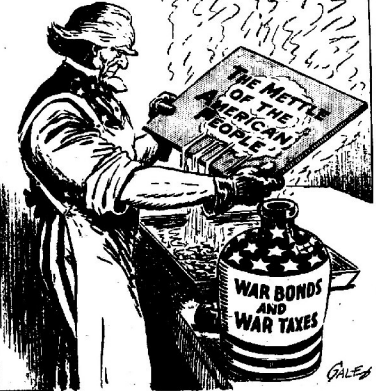
You've Done Your Bit—Now Do Your Best