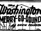
Washington, D. C.

has sufficient value to make it worth bothering about. The government does not ask you to put fats that can be used for frying or other cooking purposes into the waste fat can, but only after you have completely used up the food value. All meat cooked under the broiler, or in the roasting pan, should be a substantial contribution to the waste fat collection.