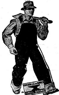
I. RICHMOND CO. PRESTONSBURG, KY.