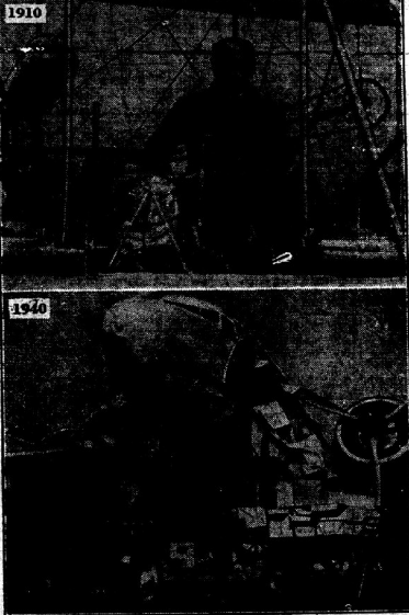
First air express shipment in history of transportation consisting of five bolts of silk weighing 50 pounds was flown 65 miles in 71 minutes from Dayton to Columbus, Ohio, in November 1910, (left) to frame of Wright plane; today, 30 years later, Railway Express Agency reports hundreds of giant transport planes are spreading daily in cargo compartments of giant transport planes for overnight delivery 1,500 miles away.