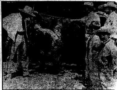
BLACKSMITH PEDIGO (WESTERN KY.)

Many citizens have volunteered cars and drivers for FREE TRANSPORTATION to the various events in and near town.