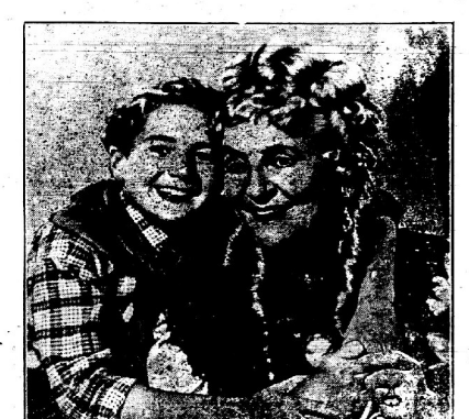
With Bobby Green as a Southern orphan boy who comes from just after the Civil War in search of his parents, and May Robson as his mother, a recently New Yorker between to be Bobby's grandmother, Bobby's new film is titled "Rainbow on the River." It is based on the popular novel, "Tollette's Phillip" by Mrs. C. V. Jamison.