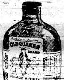
OLD QUAKER BLENDED WHISKEY • OLD QUAKER SELECTED OLD QUAKER APPLEJACK • OLD QUAKER RUM