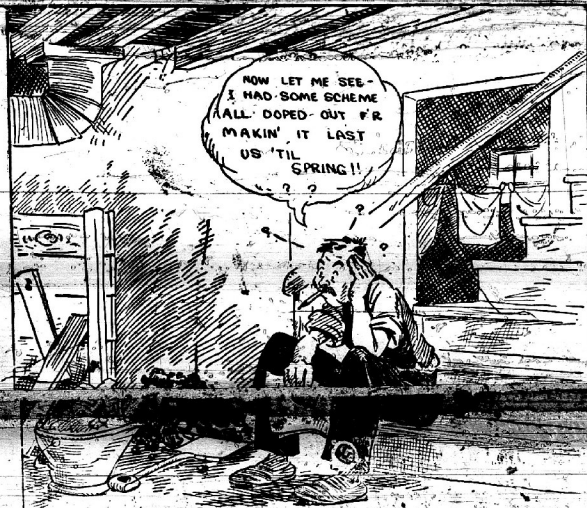
—THAT WE CAN NEVER FIGURE OUR WINTER'S COAL SUPPLY JUST RIGHT??

Color of Meteors The Leonid and Perseid meteors have a pure-white appearance when they arrive in the earth's atmosphere and burn up.