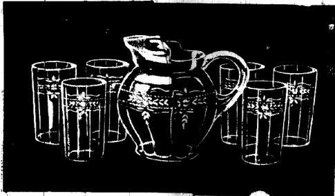
7-piece BEVERAGE SET; Macbeth Crystal Glassware. Handmade "Ice-Lip" pitcher and six Macbeth "Chip-Proof" tumblers. Free with 1 year subscription.

Wouldn't you like to have one of these beautiful glassware sets on your table? We are glad to extend you the privilege of securing one absolutely free with a subscription to the Floyd County Times. THIS OFFER OPEN UNTIL JULY 15 ONLY!