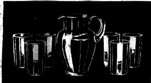
7-piece MACBETH BEVERAGE SET in rose-pink glassware. A handmade pitcher and six Macbeth "Chip-Proof" tumblers. Free with 1 year subscription.