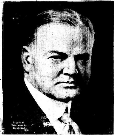
HERBERT HOOVER FOR PRESIDENT