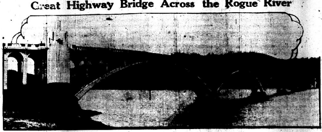
The recently completed bridge which connects the Roosevelt highway between the cities of Weathersburg and Gold Beach in the southern part of Oregon and crosses the mouth of the Rogue river, the headwaters of which are famous as the fishing grounds where President Hoover tried his luck in 1927.