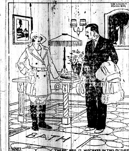
How good are you at finding mistakes? The artist has intentionally made several obvious ones in drawing the above picture. Some of them are easily discovered, others may be hard. See how long it will take YOU to find them.