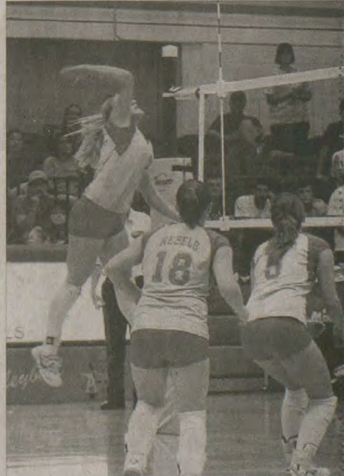
ALLEN CENTRAL captured this year's 15th Region All "A" Classic championship. The Lady Rebels are preparing for the upcoming district tournament.