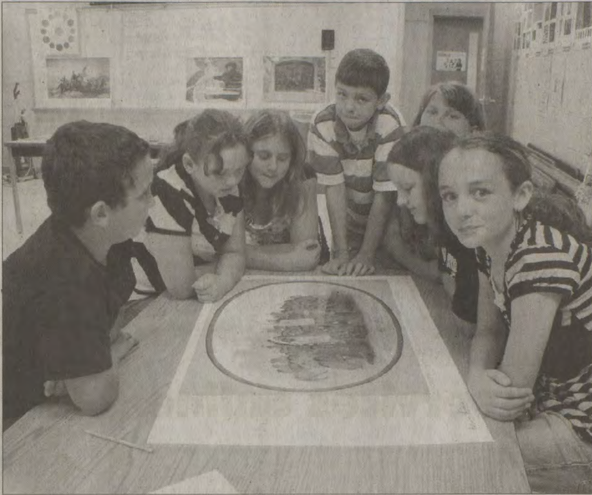
Students at Stumbo Elementary are taking advantage of "Picturing America," a program designed to introduce students to their artistic heritage.

"My buddy and I," he said, were chased from our campsite at your lake. They said it was against federal regulations to x)mp there."