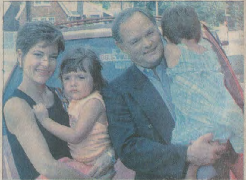
Former Lt. Gov. Steve Henry and his wife, former Miss America Heather French Henry, have hit the road this week to tour the state and get out the word that Kentuckians could have an impact on a proposed amendment to ban flag burning by contacting U.S. Sen. Mitch McConnell.