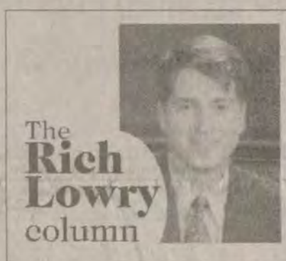
The Rich Lowry column

Rich Lowry is editor of the National Review.