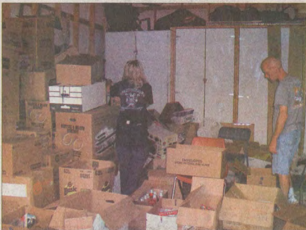
Evidence of Floyd County's generosity could be seen in the piles of supplies locals donated to hurricane victims in August and September.