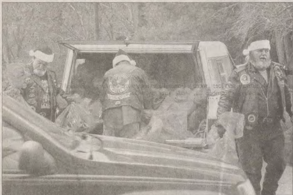
The Brothers of the Wheel showed that Santa comes in all sizes by collecting gifts for needy children this Christmas.

In May, county law enforcement, medical, emergency and education professionals staged a mock emergency at Prestonsburg High School in which a rolling meth lab crashed near the school. The drill was aimed at gauging how the county would respond in such an emergency and saw full cooperation amongst all the agencies who shared the goal of protecting area youth.