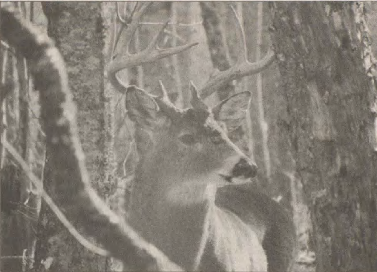
The 2006 state deer harvest still has a chance to surpass the 2005 campaign as many hunters have had success.