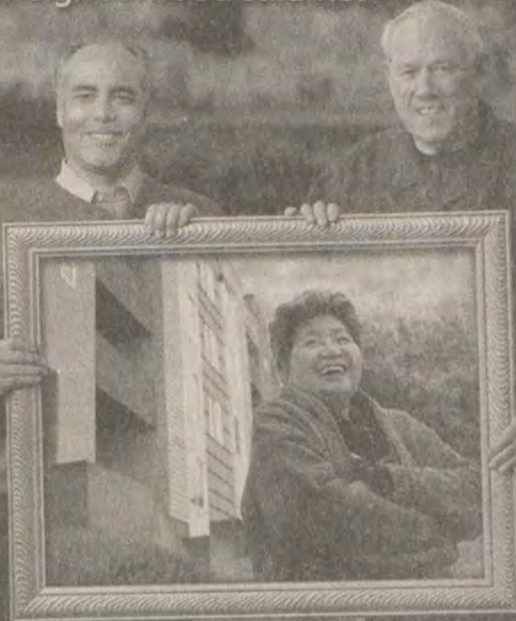
San Francisco Organizing Project, San Francisco, CA

One in ten seniors lives in poverty. One neighborhood said no.