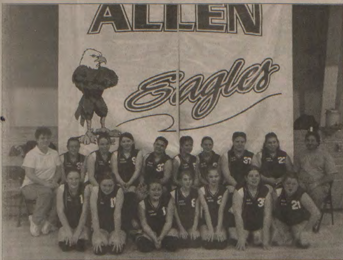
The Allen Elementary volleyball team captured the Allen Central Middle School Volleyfest championship Saturday.