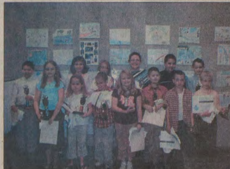
This group of students were proud to be honored at the awards banquet.