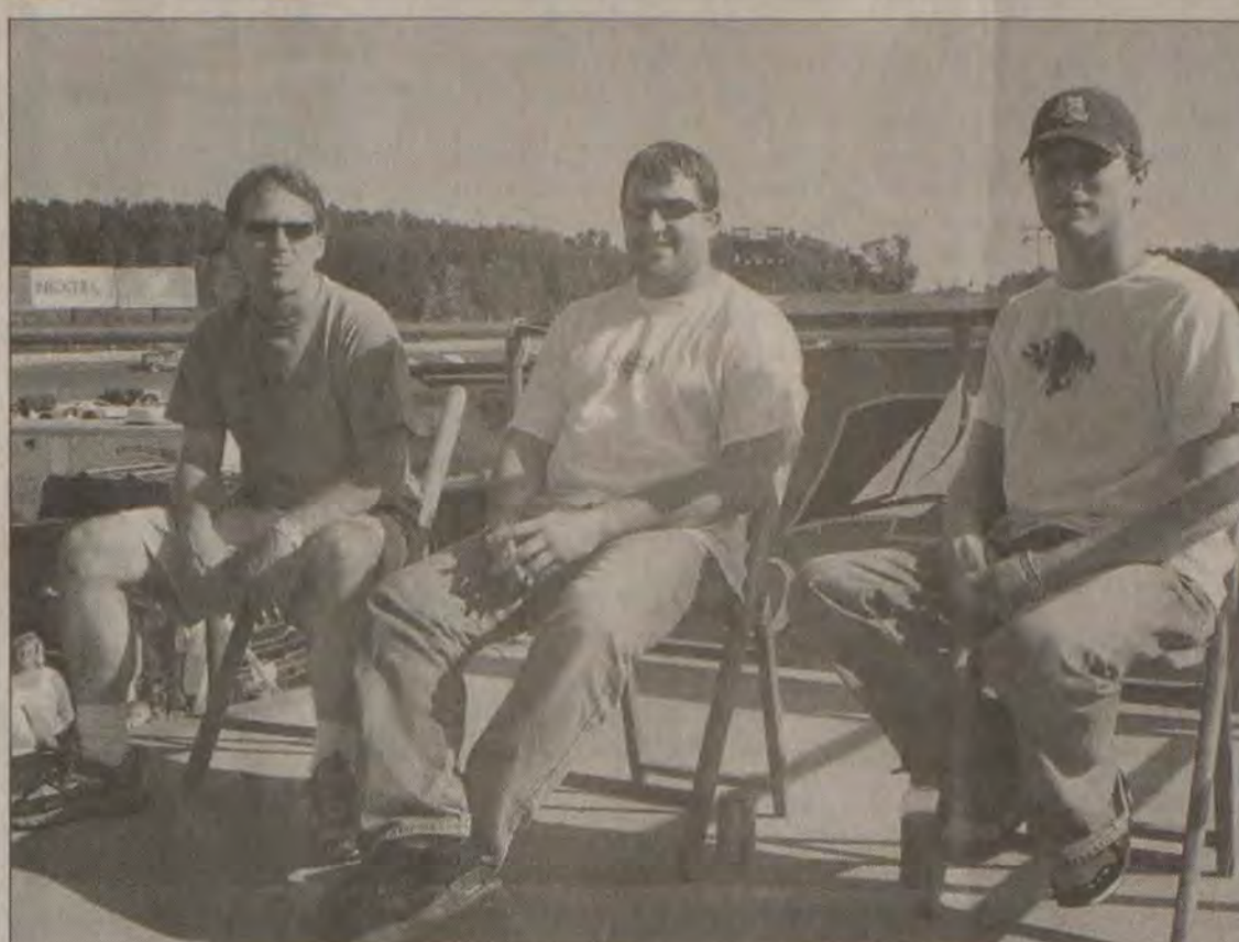
Dave Blaney (left), Tony Stewart (middle) and Kasey Kahne (right) are among the NASCAR Nextel Cup drivers to race at the Stewart-owned Eldora Speedway.

The only thing that's certain is that Biffle can't have many more mishaps or else he'll find himself locked out of the cham-