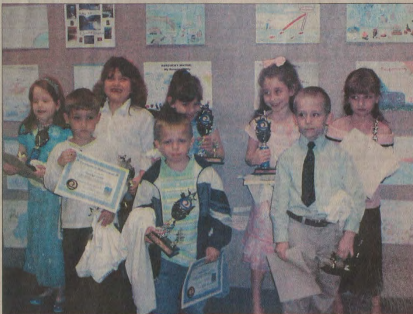
Some smiling faces with their winning awards.

The Floyd County Conservation District thanks everyone who participated in this year's FCCD events and activities