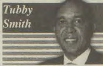
Tubby Smith