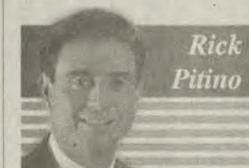
Rick Pitino

LOUISVILLE — Almost a week after Louisville's first practice, coach Rick Pitino had one word he kept repeating at media day Thursday.