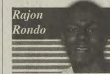
Rajon Rondo TIMES STAFF REPORT

BIRMINGHAM, Ala. — The Southeastern Conference unveiled its second annual men's basketball preseason All-