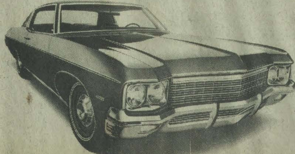
Impala Custom Coupe

Putting you first, keeps us first. CHEVROLET