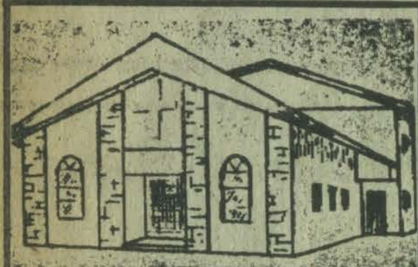
Arnold Avenue Church of Christ