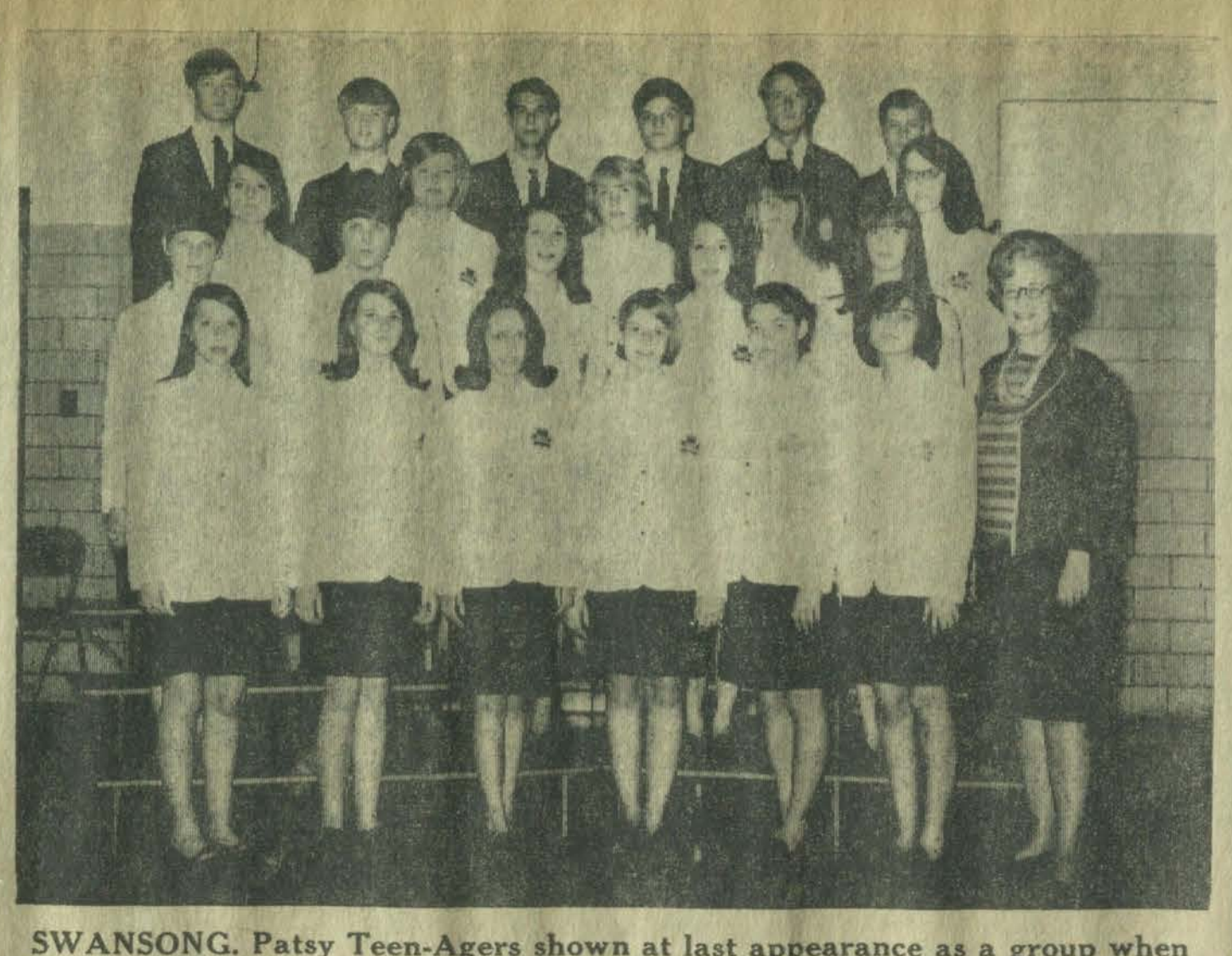
SWANSONG. Patsy Teen-Agers shown at last appearance as a group when they sang at Kiwanis Club meeting here, May 23.

STATE AND NATIONAL PARKS The finest in the nation.