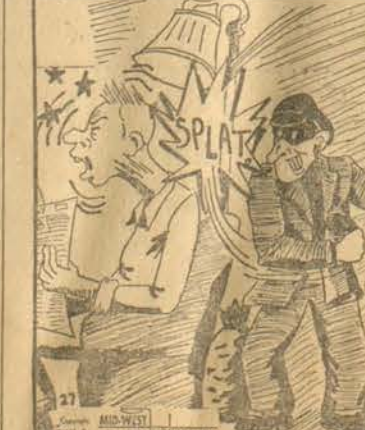
"Ouch, dear, I'll come as soon as