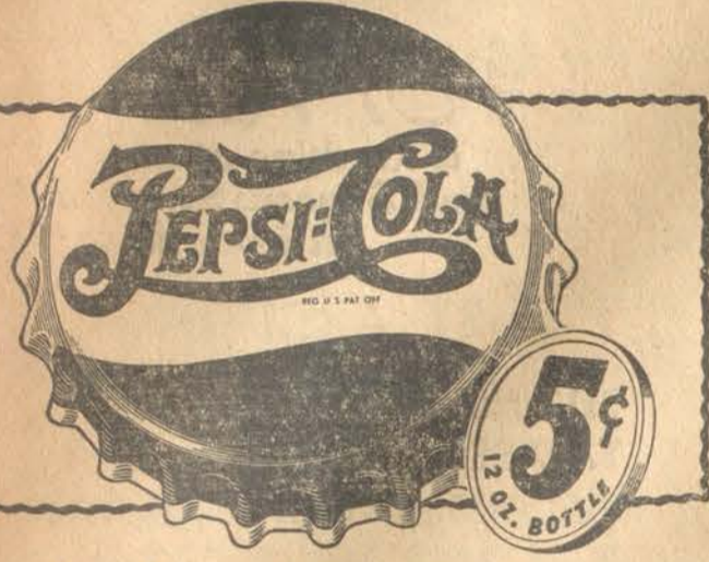
Pepsi-Cola Company, Long Island City, N. Y. Franchised Bottler: Pepsi-Cola Bottling Co., of Pikeville