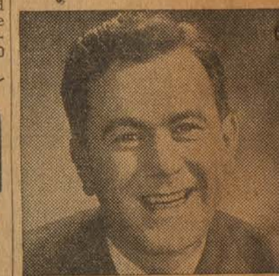
"He's an expert, too. Sells the finest lubrication there is. So I'm going his way—and we'll ride right up to that new car!"

*GULFPRIDE FOR YOUR MOTOR An oil that's TOUGH in capital letters . . . protects against carbon and sludge!