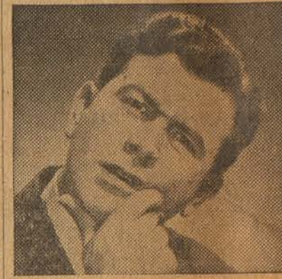
"But that auto expert said in the paper that we may have to make our old cars last for 2 or 3 years after victory. That's bad news for me!"