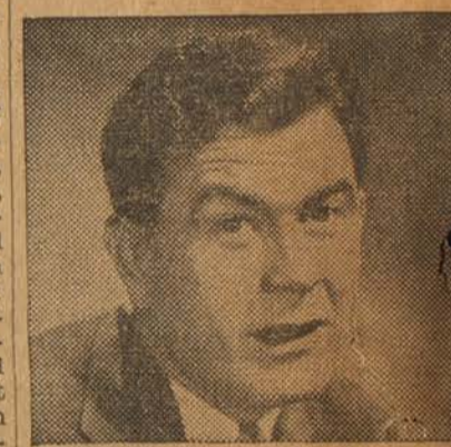
"My Gulf man had some good news, though. He said Gulfpride* and Gulflex** will help keep my car on the road for a long time—more than likely until I get a new one."