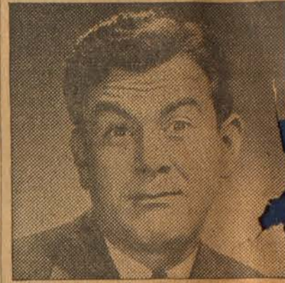
"I've been figuring on a new car soon as the shooting stops."