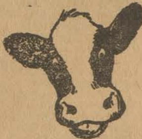
WFA's 3-Point Dairy Program