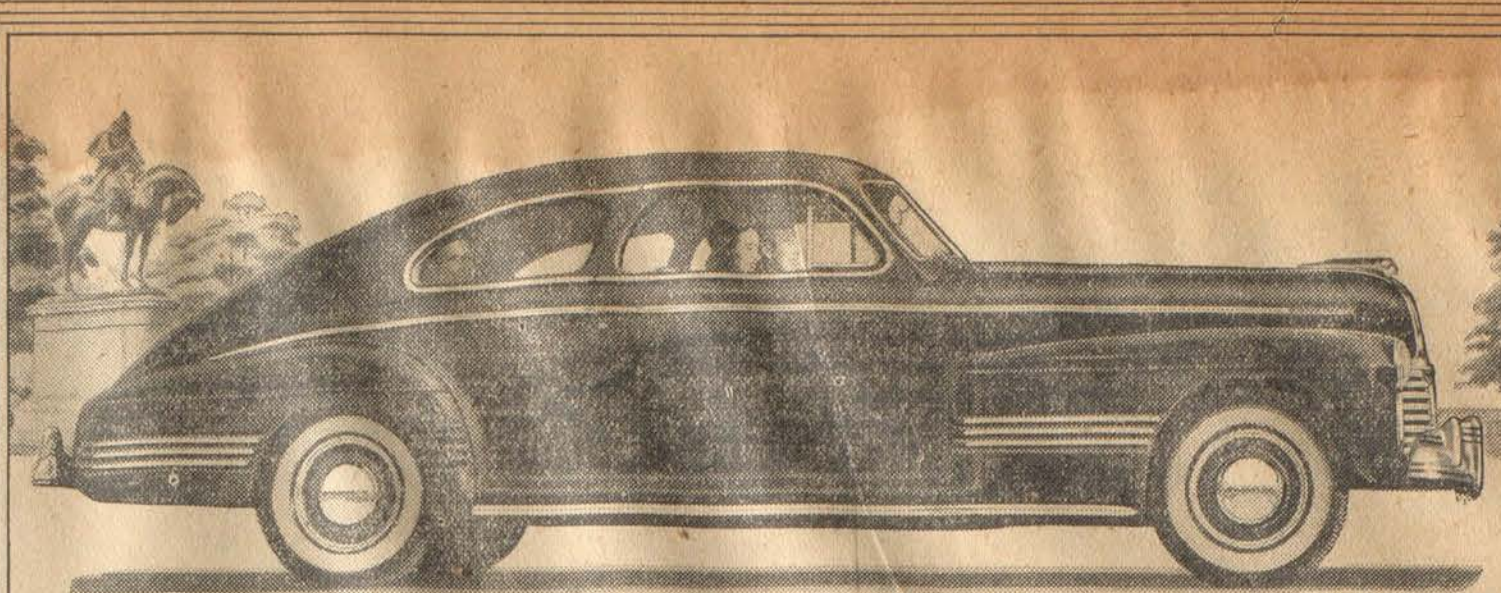
Streamliner "Torpedo" Six Sedan Coupe $923* (white sidewall tires extra)

The Woman's Society of Christian Service of the Methodist Church will have a Silver Tea at the parsonage, Friday, March 21, from 3 p. m. to 5 p. m. and from 7 p. m. to 9 p. m. The public is invited to attend. There will be an interesting display of antiques and heirlooms.