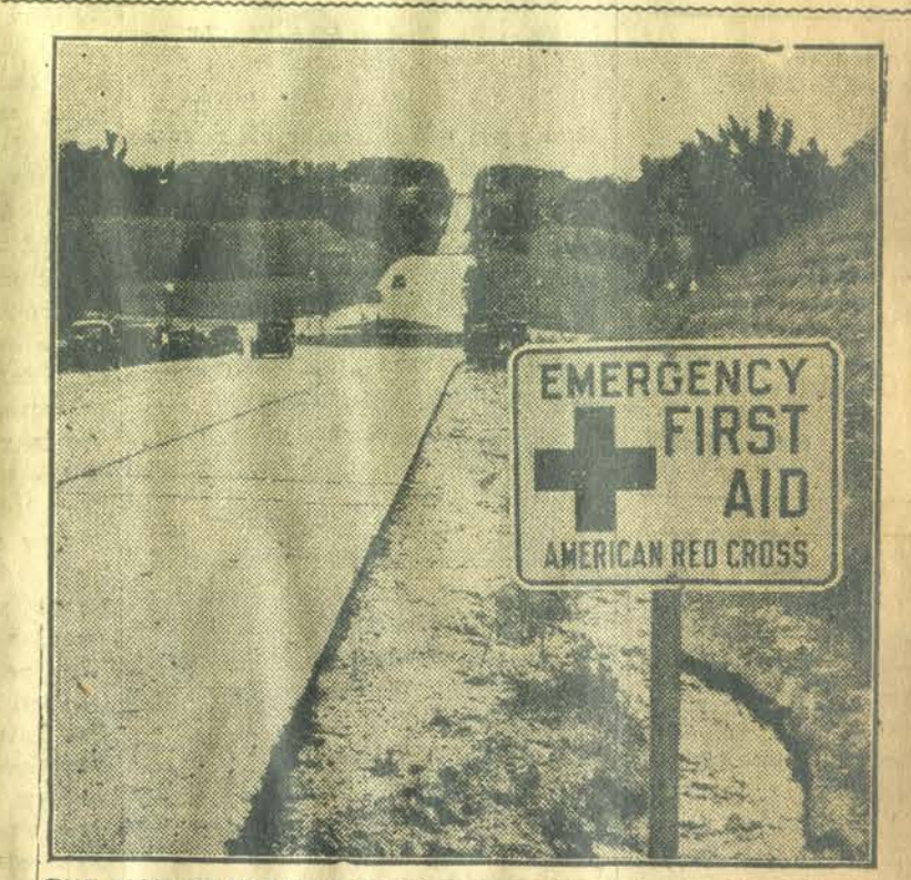
THE SIGN OF SAFETY-Where you see this marker on the highways of the nation you are assured that should an accident occur, there is a trained Red Gross first alder nearby to give assistance to the injured.

Father: "No, my boy, provided you don't draw on me."