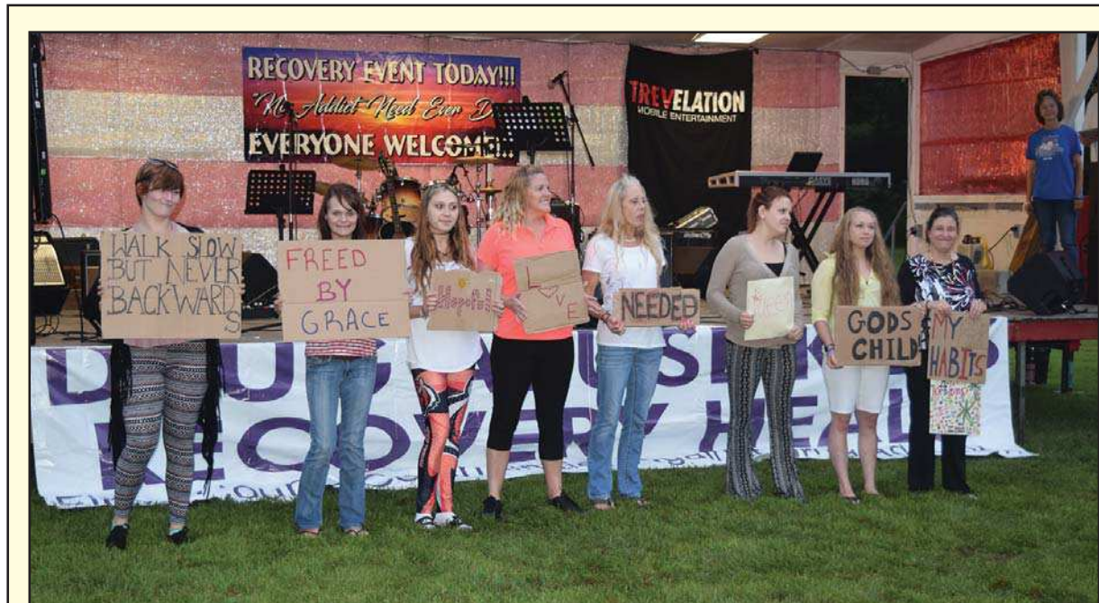
A group of women, who recently entered into a recovery program, shared motivational phrases of their recovery before a cheering audience during the Prestonsburg Recovery Celebration Saturday.