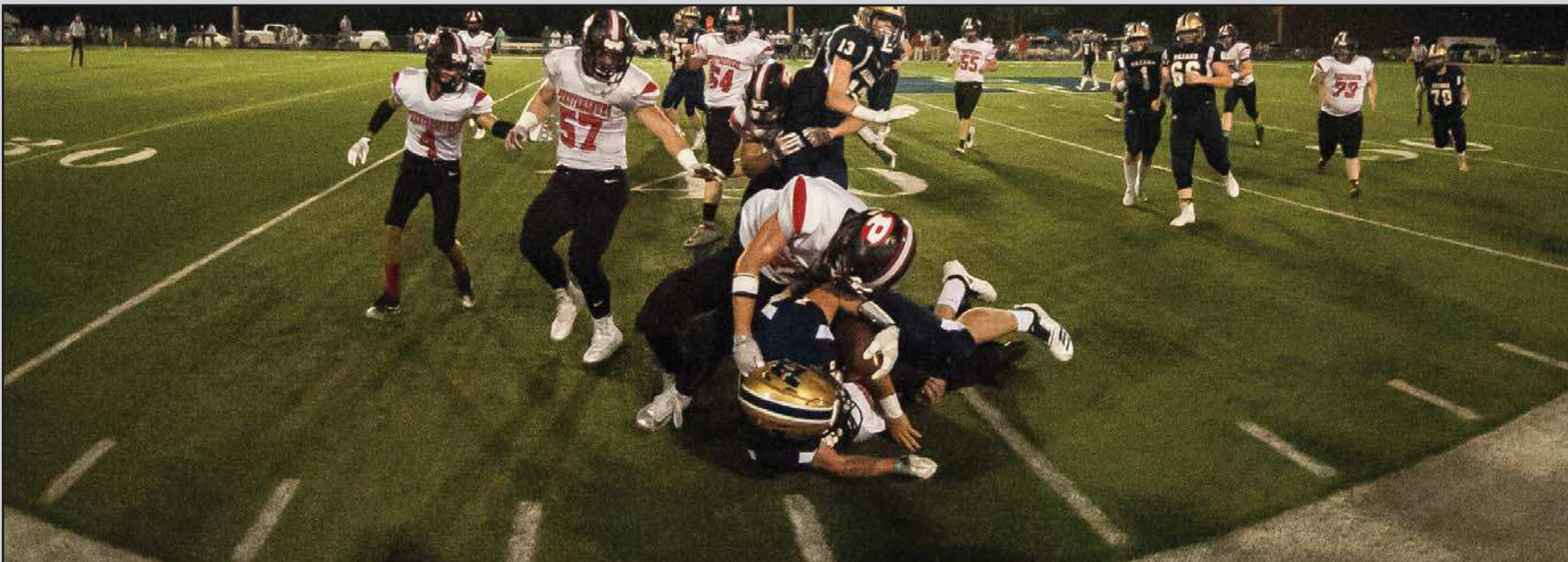
Prestonsburg defenders make a stop Friday night at Hazard. The Blackcats fell to the Bulldogs, 44-12.