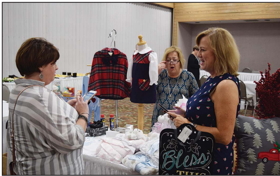
The 2018 Big Sandy Small Business Expo, hosted by the East Kentucky Small Business Development Center at Morehead State University, took place Thursday evening at the Jenny Wiley State Resort Park Convention Center, welcoming more than 40 small business owners and representatives to the networking and education event.