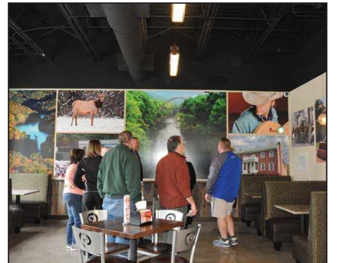
The new Prestonsburg Double Kwik features a mural of photographs by local photographers.