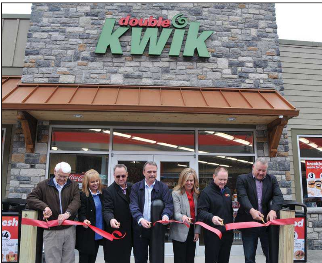
Officials cut the ribbon to open the new Double Kwik location in Prestonsburg on Monday. The store opened to the public Tuesday.