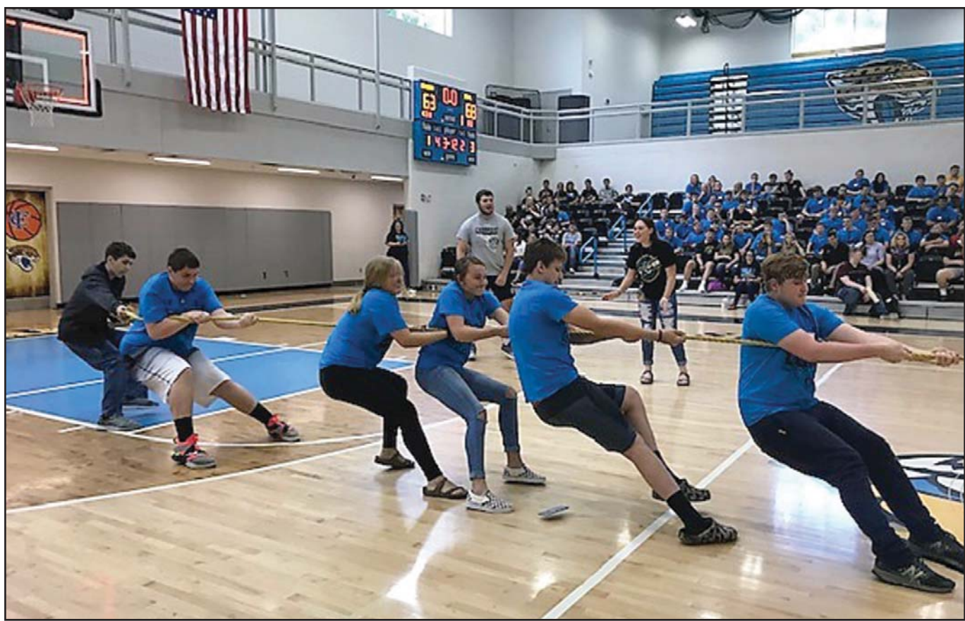
Submitted photos Students from Duff-Allen Central and South Floyd participated in numerous activities during the student-led "Step Up Day" at Floyd Central.

For more information, call, (606) 886-6709.