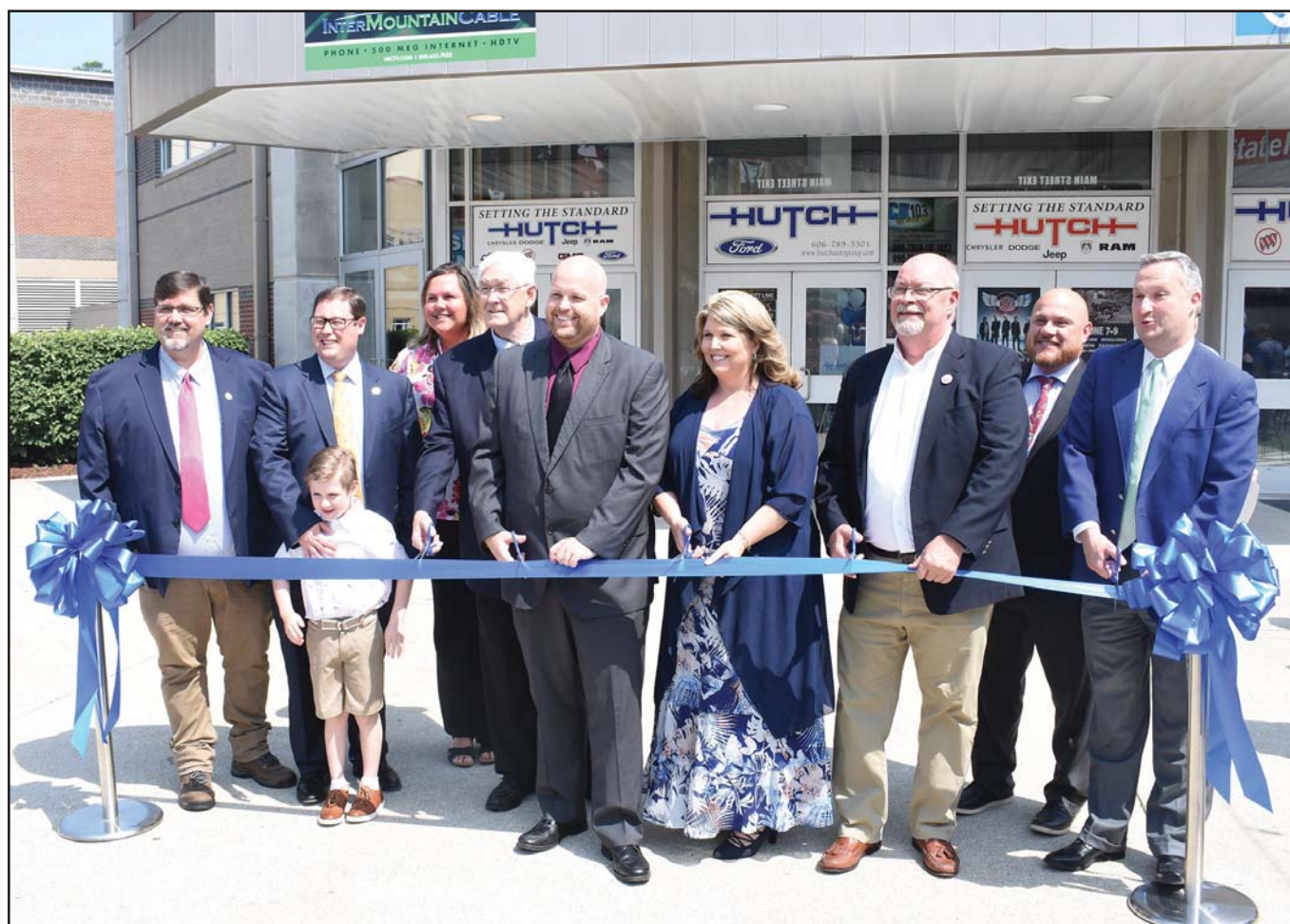
Officials cut the ribbon Monday to mark the official naming of the former East Kentucky Expo Center the Appalachian Wireless Arena.