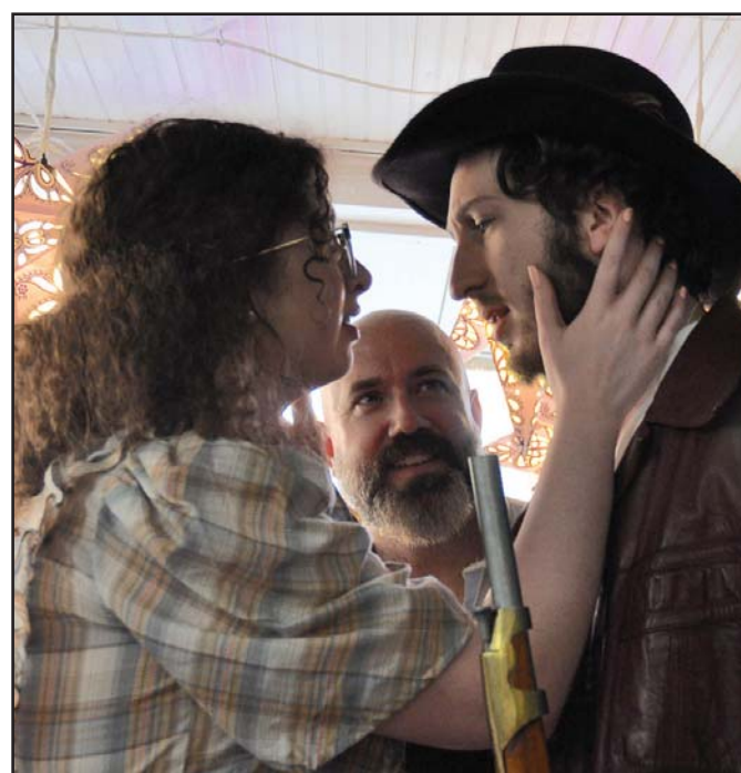
"A Midsummer Night's Dream: An Appalachian Folktale" will be held Thursday through Saturday at Middle Creek National Battlefield.